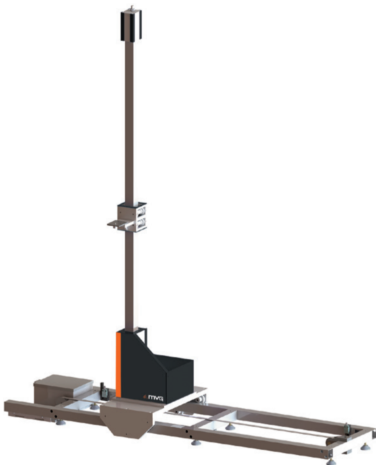
Field Probe Positioner (FPP-16)

The mechanical design, with built-in limit switches, ensures safe and reliable operation. The FPP-16, with the exception of the drive unit, is fabricated from plastic (PVC and reinforced fibreglass). Metal parts are located only in the base plate and the drive mechanism (max 0.3 m above ground level). This allows for accurate measurements with negligible electromagnetic interference from the FPP-16 positioner. The IEEE 488.2 (GPIB) bus provides an additional control option for all functions, when operated with the MCU or NCD Controller.