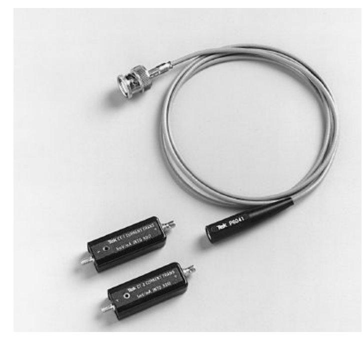
CT1/CT2. Current Probes with P6041 BNC Probe Cable