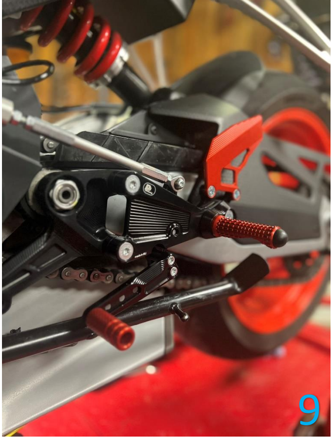
PP Tuning Racing Parts, Jezeřany-Maršovice 328, 671 75 Loděnice, Czech Republic <a href="https://www.pptuning.eu">www.pptuning.eu</a>

Thank you for purchasing our product. We wish you many happy miles without accidents.